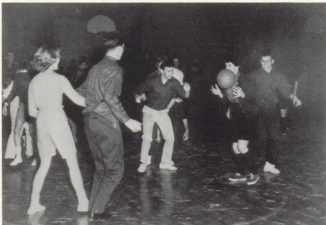
"Don't devour it."