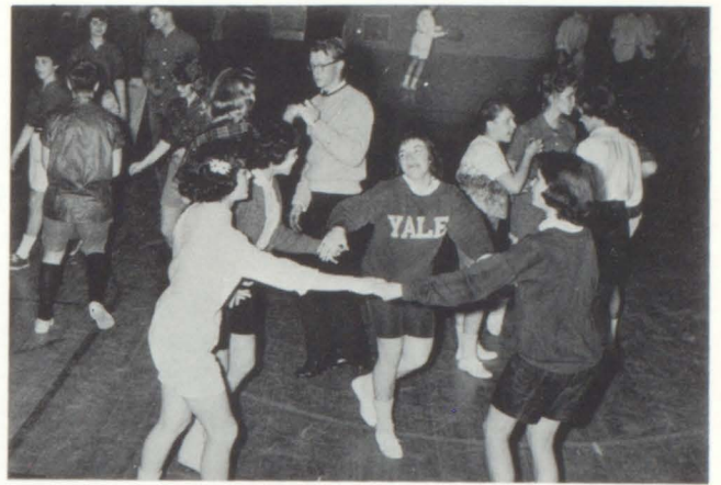
"Odds and Ends"