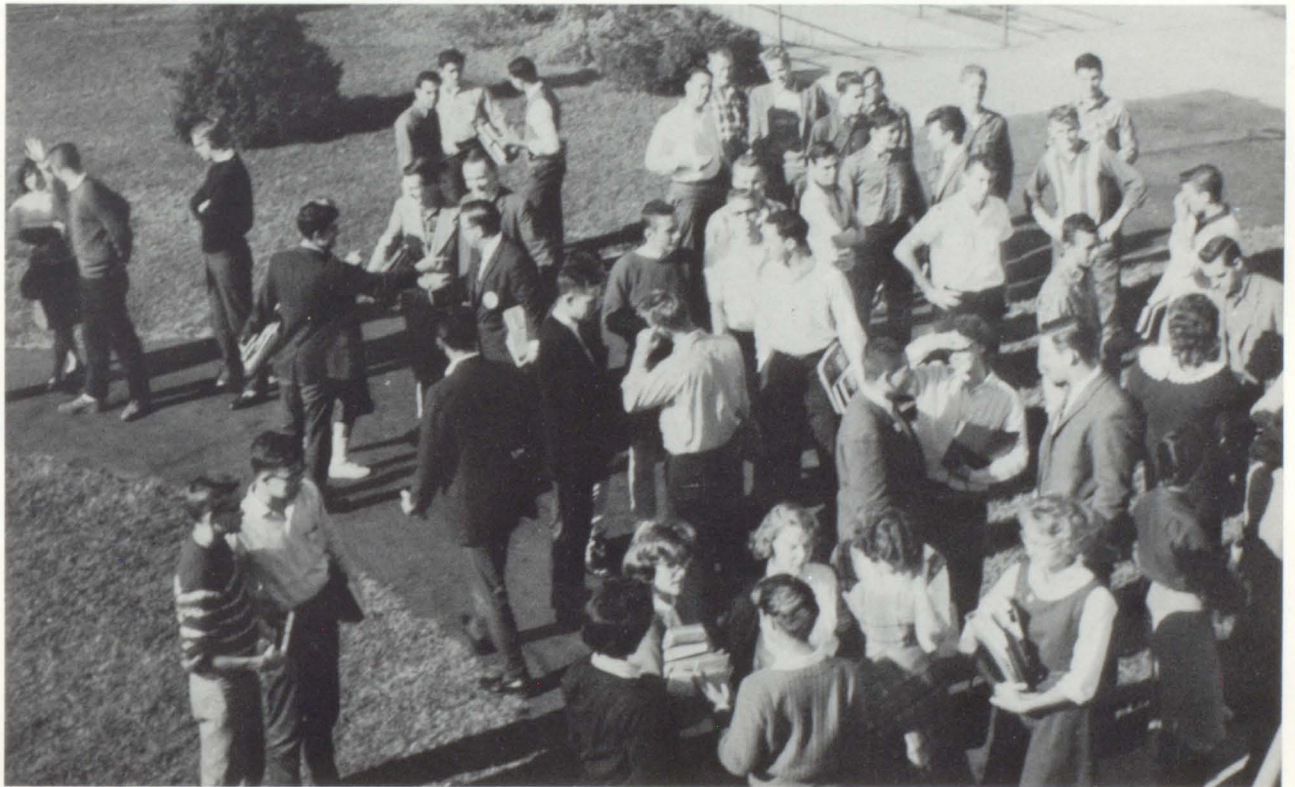
"Who's going to get a tan in five minutes?"